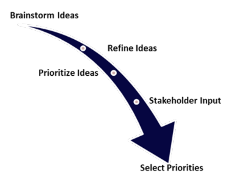
Figure 3. Framework for ICDR Strategic Plan