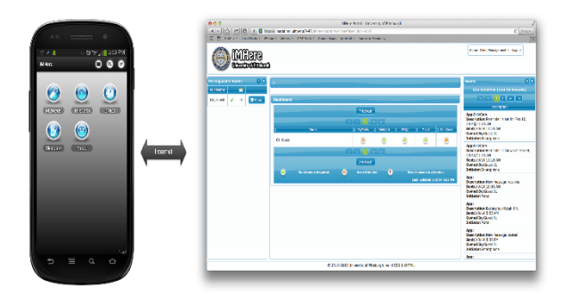
FIGURE 4: IMHERE APP (UNIVERSITY OF PITTSBURG)

created a mobile health systems app called <u>iMHere</u> (see Figure 4). Designed for the aging population and those with chronic conditions and/or disabilities, the goal is to break the common intervention of bringing therapists to consumers' homes to teach them about preventative self-care and monitoring. The current model of iMHere has two interfaces, a consumer side and a clinician side that includes five health sub-apps such as skincare, mental health, and medication. A clinician