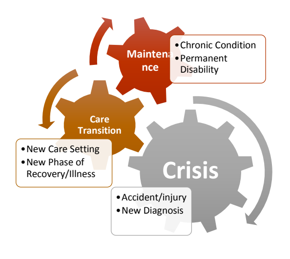
FIGURE 1: CAREGIVING INFORMATION CYCLE

Sterling opened the panel with some demographics. According to Pew Research, 39% of adults are caregivers equating to 95 million people who are at the front lines of healthcare. She cited a RAND study that calculated the cost of caring for U.S. elderly at $522 billion a year. Patient portals are not user friendly or interoperable, and they vary from provider to provider. Accessibility barriers are not limited to physical access to data or information. An important aspect of accessible health records is making